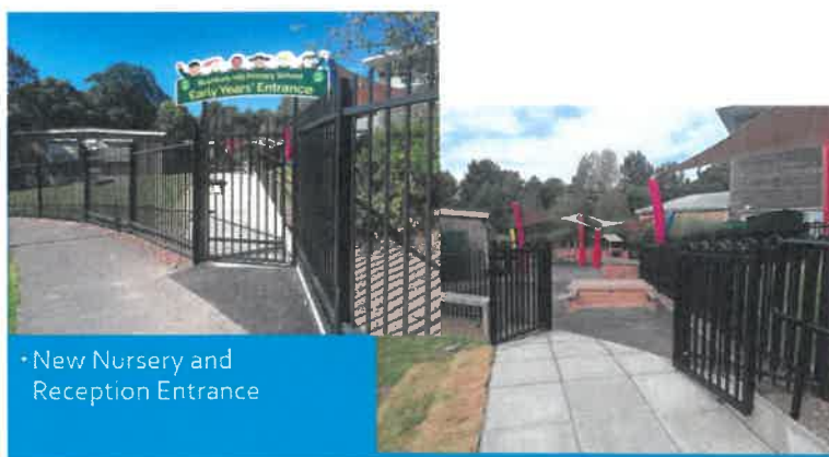
• New Nursery and Reception Entrance